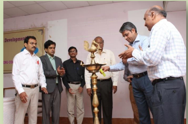
Lighting the Lamp at Industry Institution Interaction

Seminar on “ Universal-Industrial Cooperation, Creativity, Diversity and Entrepreneurship ” in Computer Science” 10 th September, 2015