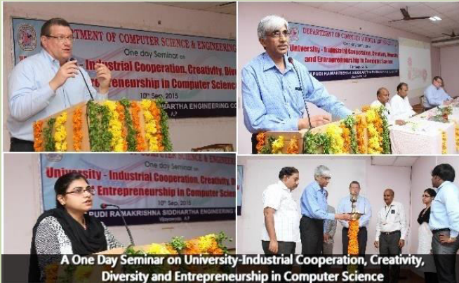
A One Day Seminar on University-Industrial Cooperation, Creativity, Diversity and Entrepreneurship in Computer Science

Seminar on “ Universal-Industrial Cooperation, Creativity, Diversity and Entrepreneurship ” in Computer Science” 10 th September, 2015