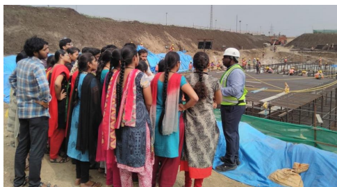
3/4 B.Tech students visited Amaravati High Court, Engineer Explaining about the foundation

In this quarter students visited various Civil constructions to improve their knowledge in field and get exposure