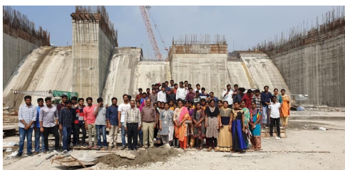
Field visit to polavaram for 3/4 B.Tech students