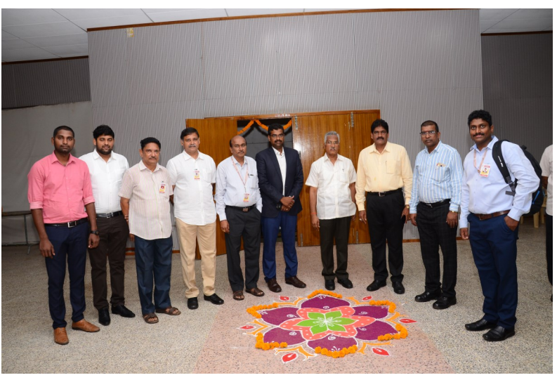
Guests of honor and others