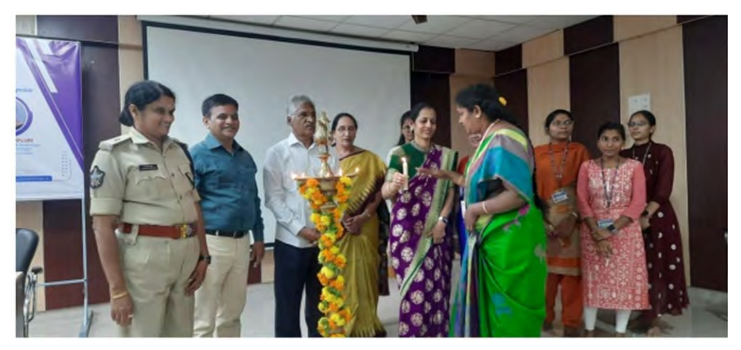
International Women Leadership Conclave held on 8th March 2023 in association with IEEE VRSEC WIE AFFINITY GROUP