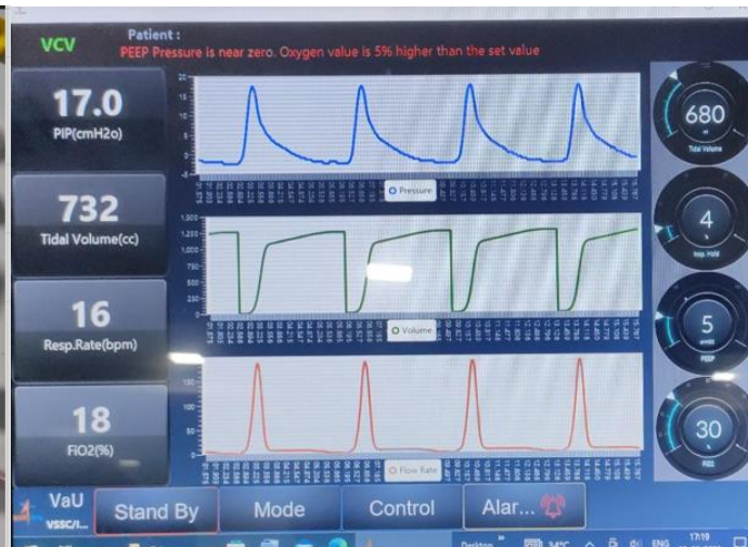
Waveforms for Volume control ventilation