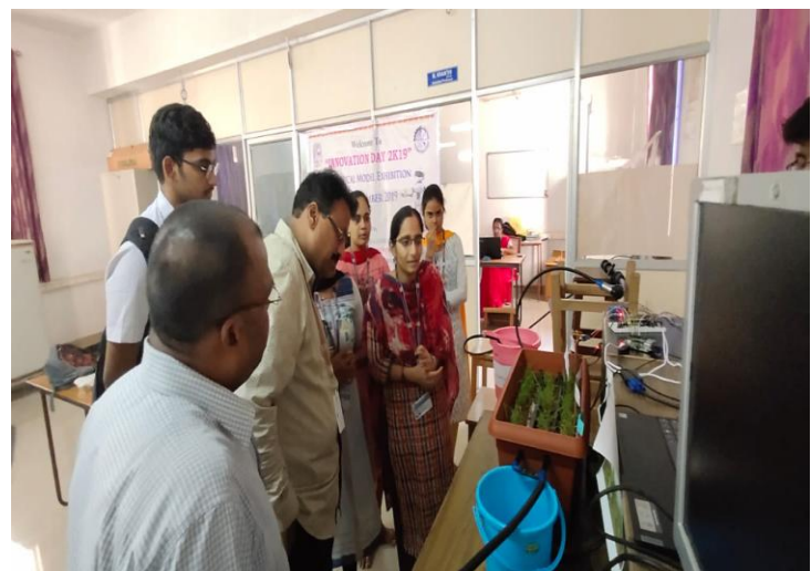
Model Name: Smart Irrigation