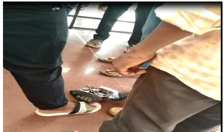
Model Name: Unmanned Ground Vehicle with object detection and live video