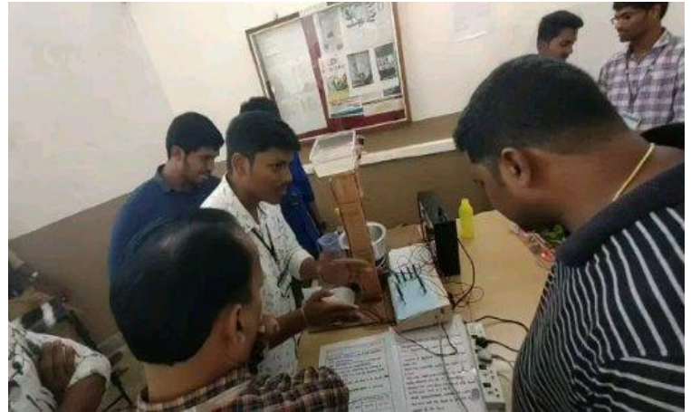
Model Name: Eco friendly