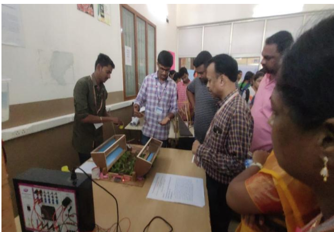
Model Name: Crop field protection