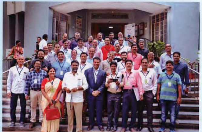
Gathering at Jubilous Event