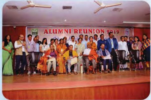
Teachers of EEE Department being felicitated