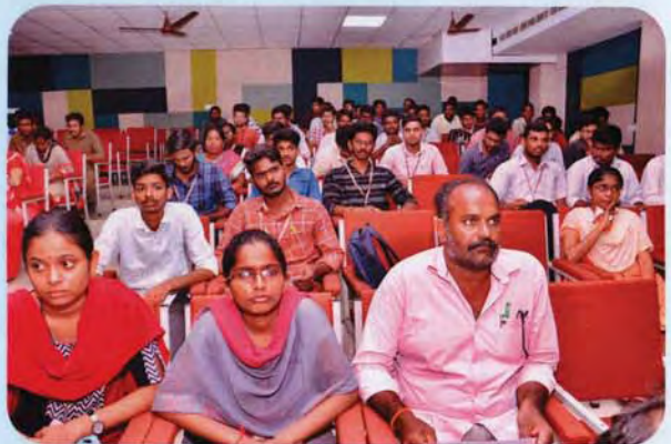
Student Beneficiaries and their Parents during distribution of Siddhartha Sahaaya Scholarships.