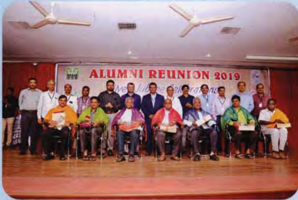
Teachers of Civil Engineering Department being felicitated

The grandeur of gratitude was all pervading in the felicitations to the available members of faculty of 1990-94batch by the silver jubilee batch of the students.