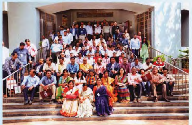
Batch of 1990-94