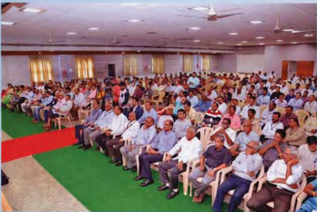
Alumni Back at Home