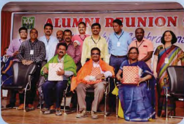
Teachers of ECE Department being felicitated