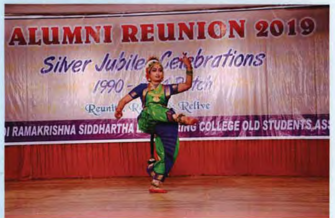
Manifesting the cultural connect