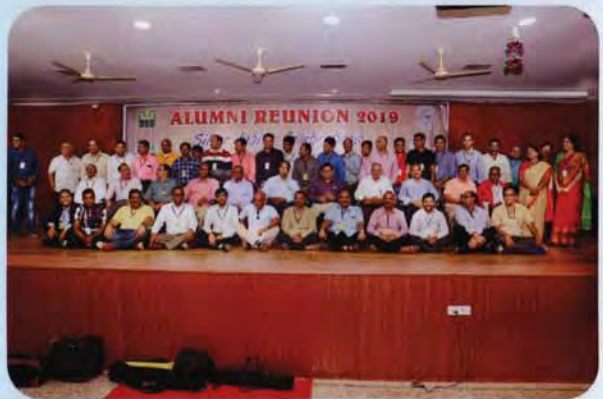
Teachers of ME Department being felicitated