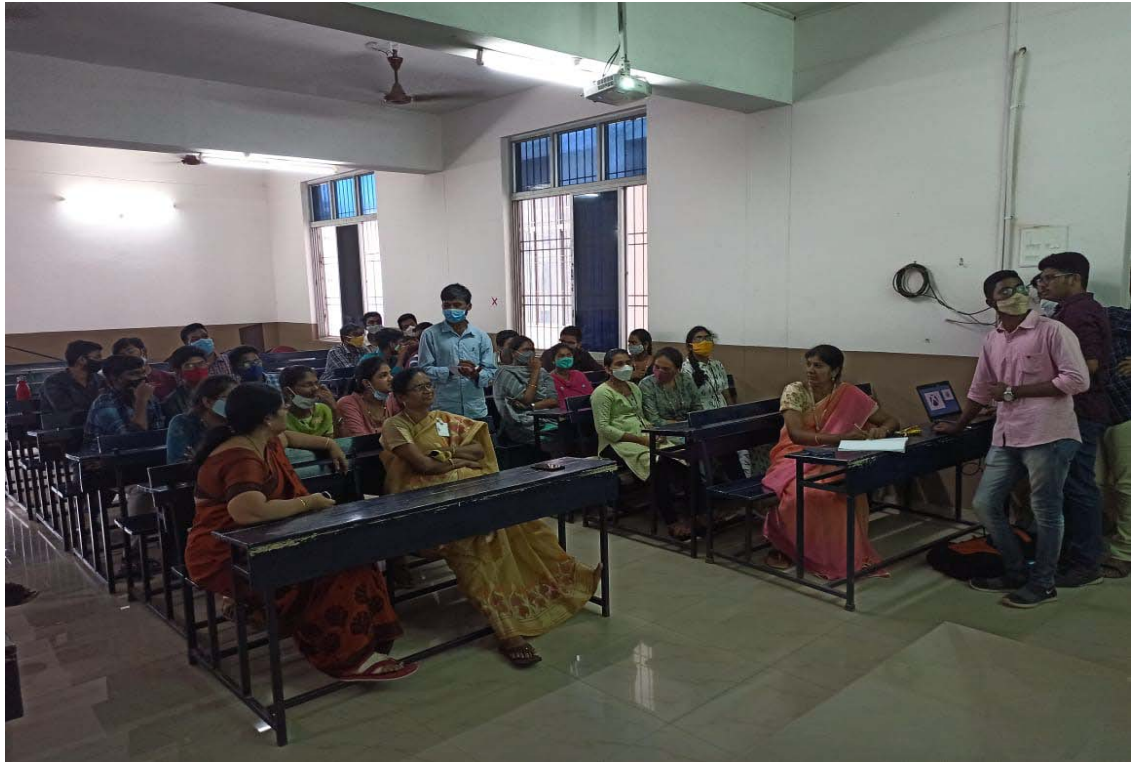
Teams participated for the Round -2