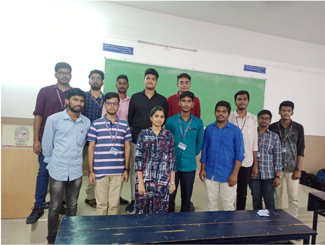
Student coordinators with the final winner and runner team