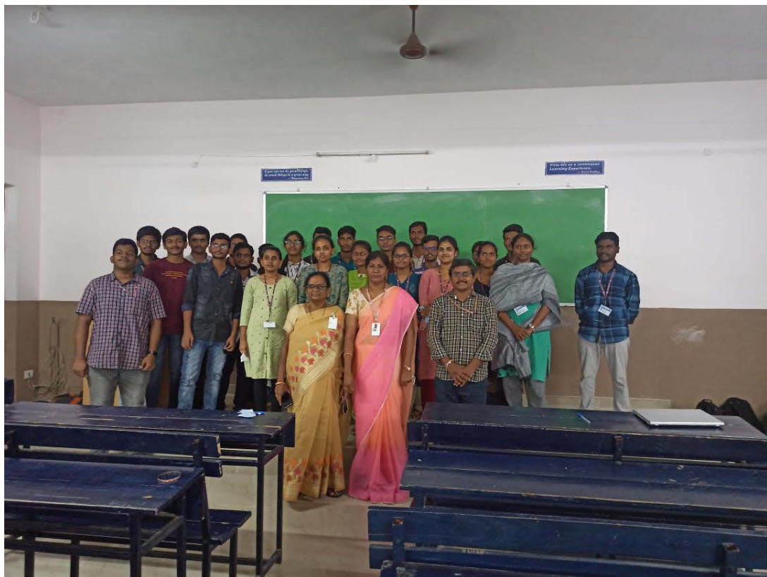
Convenor and Faculty Coordinators of the event with participants