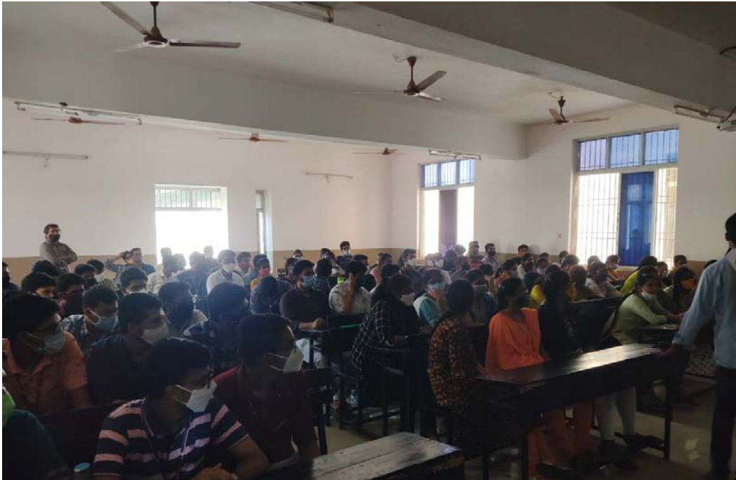
Total teams participated in the first round

In the first round, a written test with 20 questions with multiple choices from different topics was conducted to test the technical knowledge of the students. Total 29 teams were appeared for this round and the students are instructed to answer the questions within a span of 10 minutes. The answers were evaluated by the student coordinators and the highest scored top 10 teams were granted the opportunity of participating in the second round.