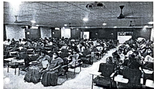
Faculty and students participants in the seminar