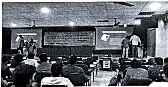
Students participation in activity session