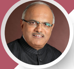
VINAY SAHASRABUDDHE, Member of Parliament- Rajya Sabha., Chairman, Parliamentary Standing Committee on Education, Women Children, Youth & Sports